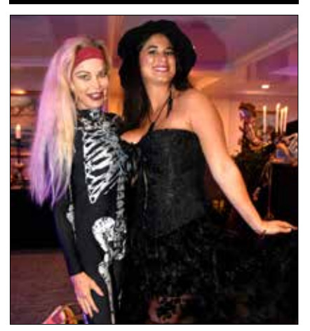
The Social Diary: Cheers to La Jolla spirits SEE PAGE 9