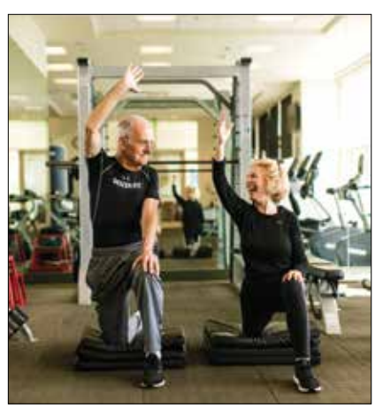
Stay strong and feel younger with these tips SEE PAGE 6