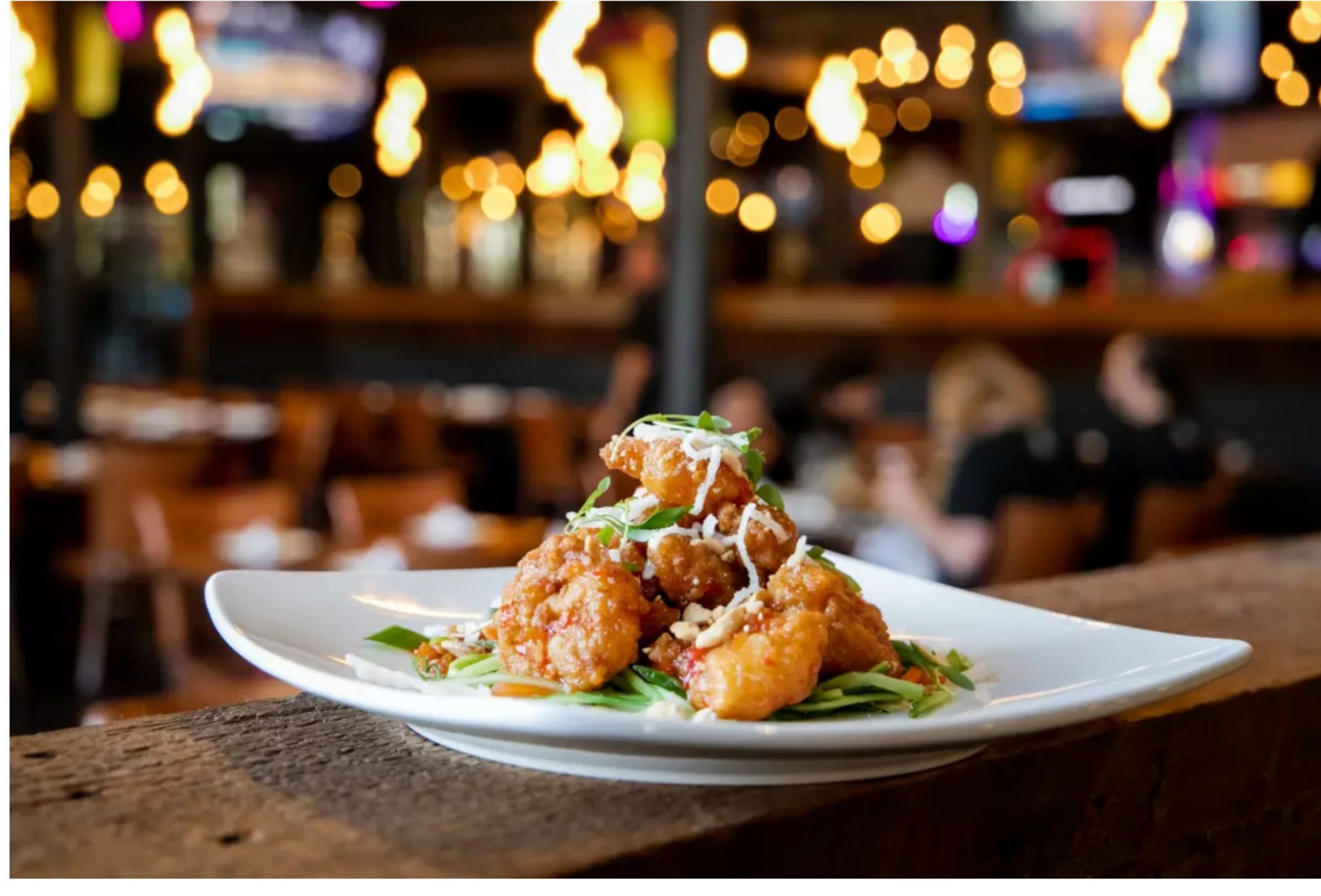
Draft Republic San Marcos offers wings tossed with the choice of buffalo, house barbecue or sweet & spicy chili-lime sauce, served with blue cheese or ranch dressing.

Draft in Belmont Park: For wing lovers, Draft sports bar in Belmont Park is a destination spot to watch the Super Bowl. Draft will have a wing eating contest and football square games, along with a 31-foot LED screen and over 25 TVs to watch the game. Plus, there will be a special Super Bowl menu with traditional tailgating food, shareable bites and drink specials. Fans can also reserve a VIP table in an area with 360-degree views of the game, lounge furniture and bottle service. To reserve a VIP table email vip@draftsandiego.com . 3105 Ocean Front Walk, San Diego. (858) 228-9305. belmontpark.com/restaurants-san-diego-ca/draft-belmont-park