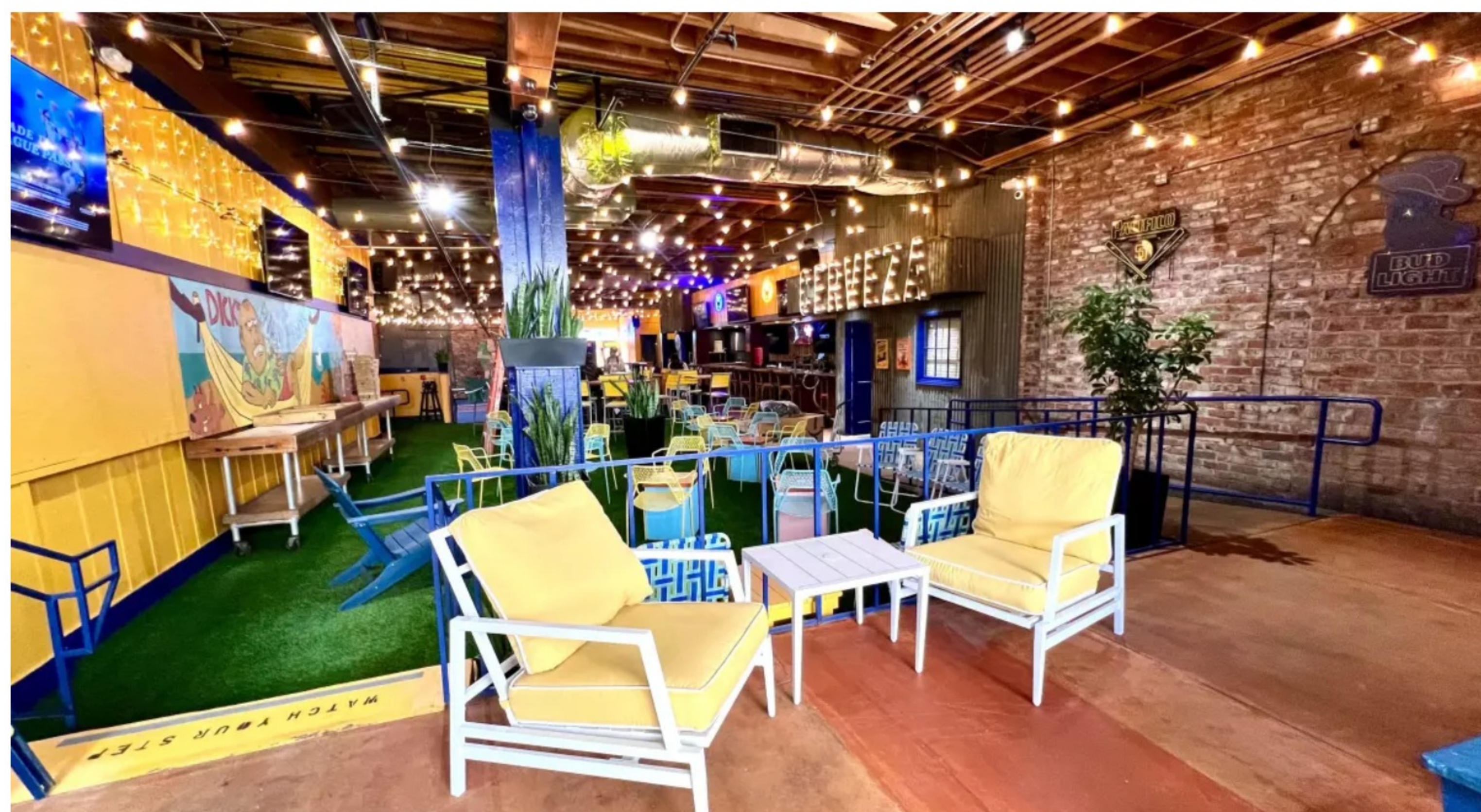
Happy Does is sports bar in the Gaslamp Quarter with drinks specials, a food menu and a new game room with classic arcade games, foosball table, darts, pickleball table and more.

Fairmont Grand Del Mar: Get a game day buffet feast and watch the Super Bowl at the Fairmont Grand Del Mar. The buffet will have tailgate food and snacks, and the event will also have drinks and football square games. The watch party starts at 2 p.m. and goes until the game is over. The cost to enter this event will be $89 per person for buffet only, $49 per person for limitless beer and $119 per person for unlimited buffet and beer servings. 5300 Grand Del Mar Court, San Diego. 858 314-2000. granddelmar.com/events/big-game-party