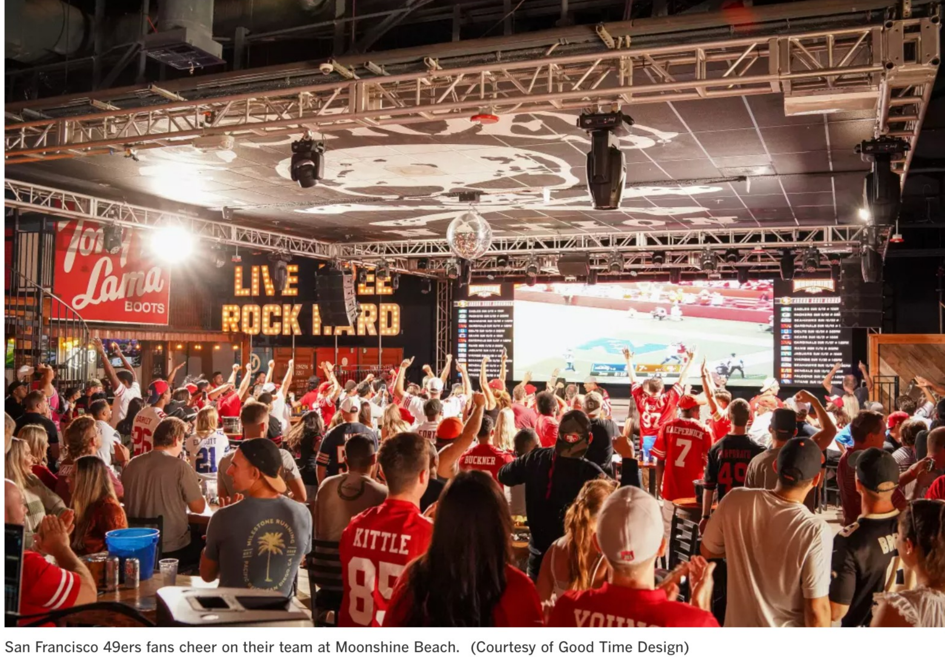
San Francisco 49ers fans cheer on their team at Moonshine Beach.